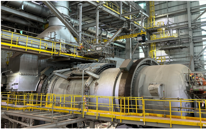
Detailed Engineering applied within for best uniform heating & execution