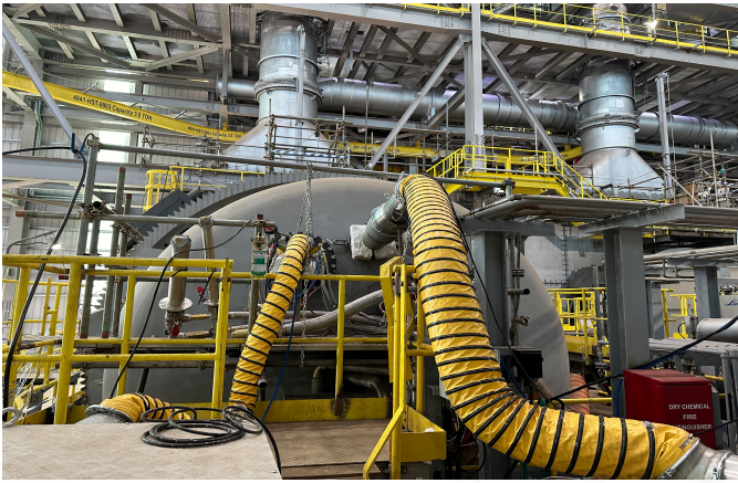
HV3000 Heat Up system